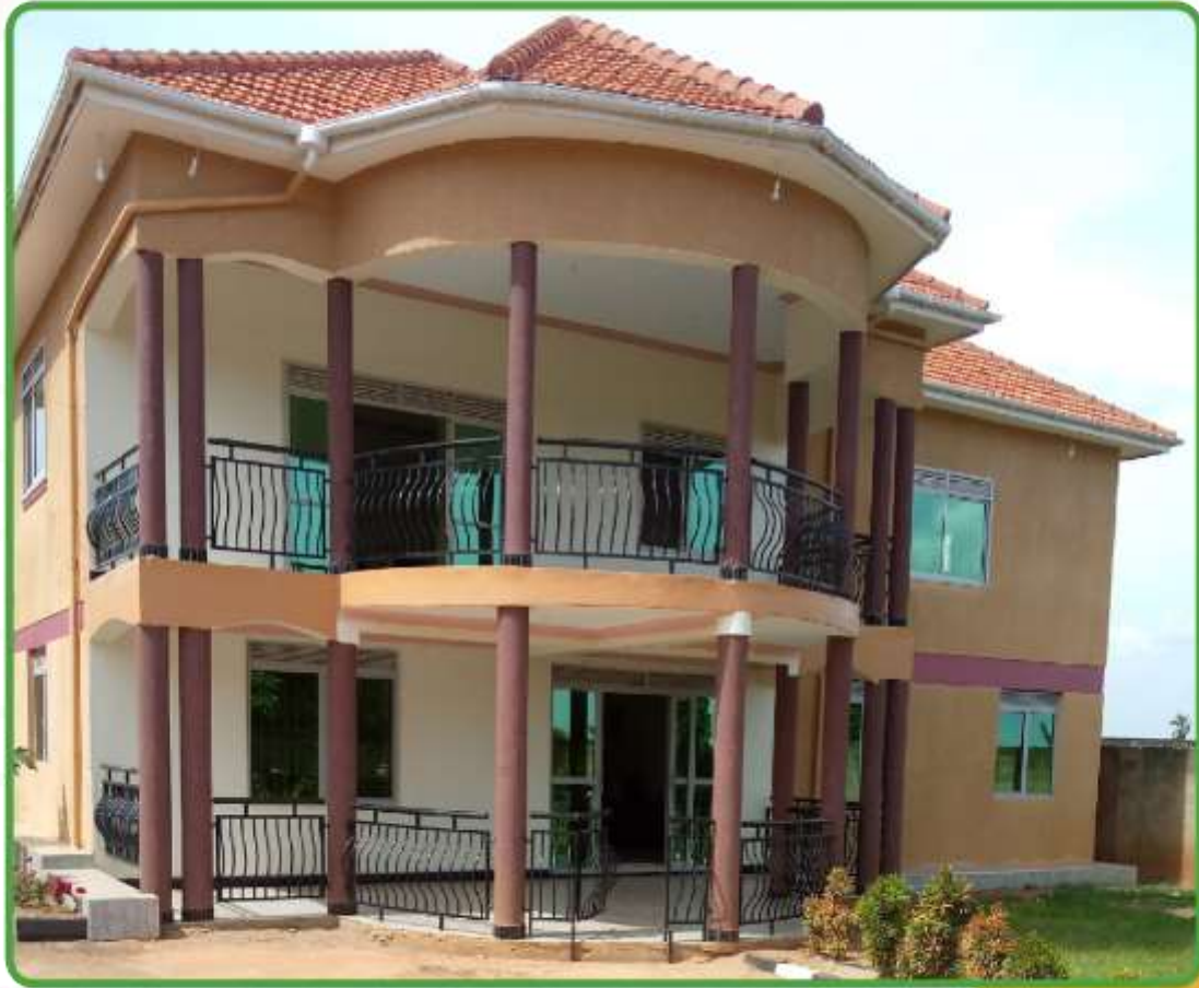
The AAYC Secretariat