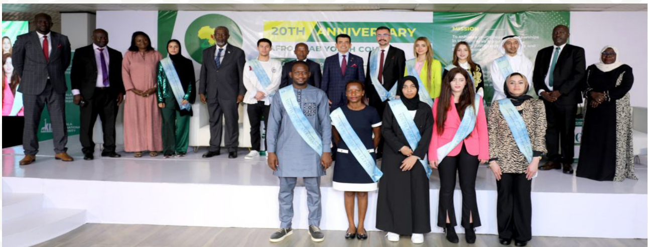
The new cohort of the ICESCO Youth Peace Ambassadors