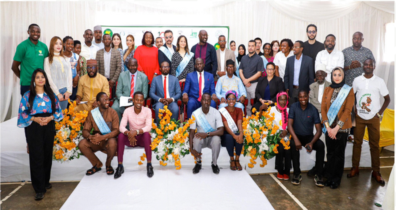
AAYC group photo moment at IUIU Kabojja Campus