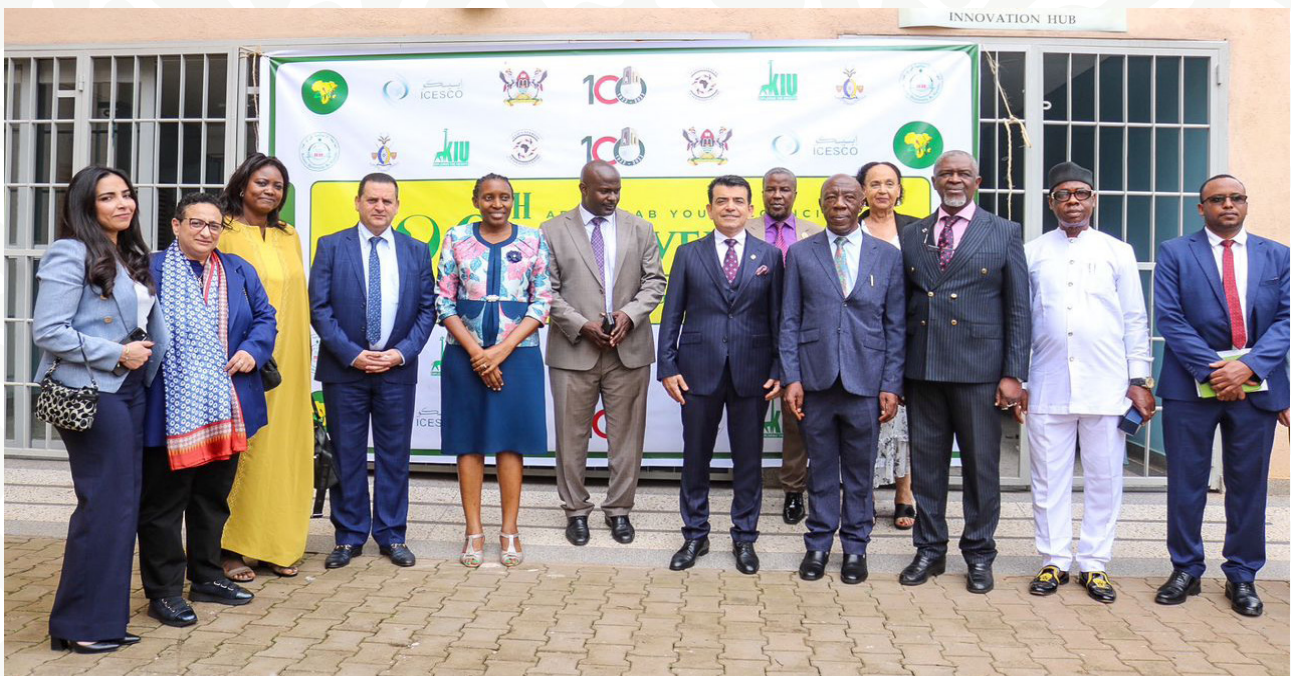
Visiting delegates at the opening ceremony

the AAYC membership, Islamic Educational, Scientific and Cultural Organization (ICESCO), key continental and global institutions like the United Nations (UN), National Youth Councils & organizations like the Pan African Youth Union (PYU), Patrice Lumumba Foundation and Private Sector partners among others.