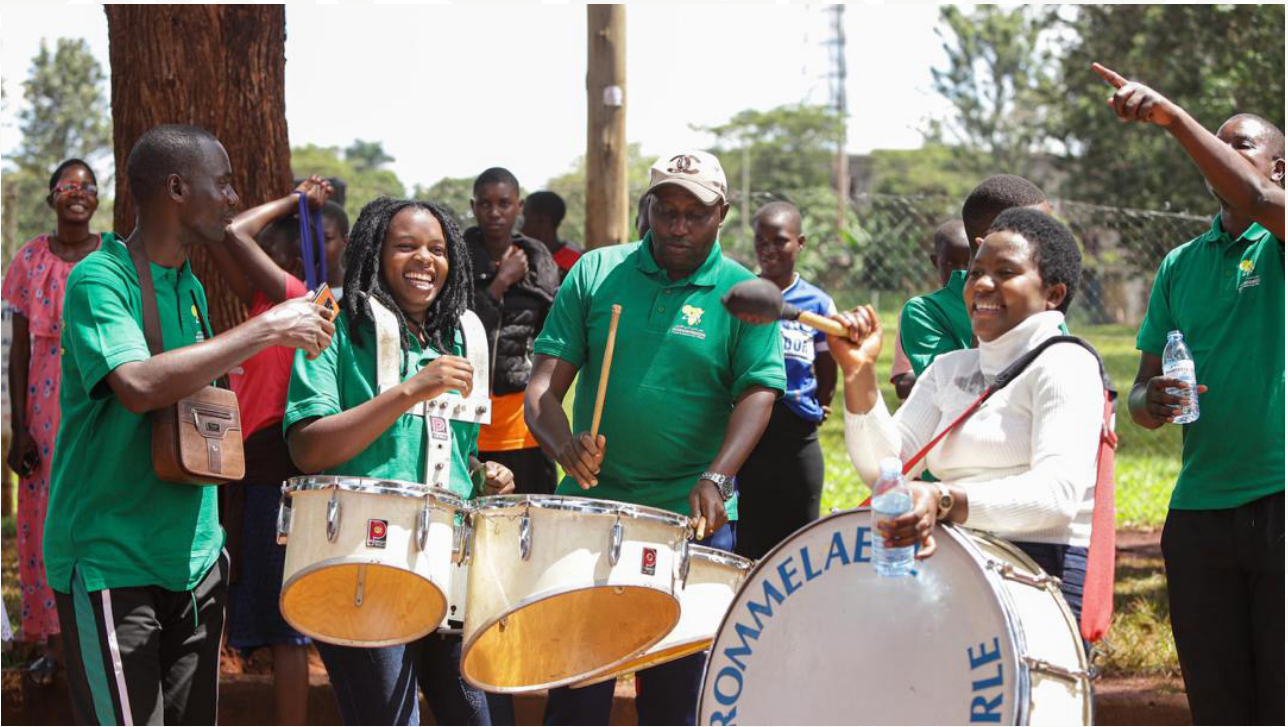
The delegates taking part in the Band Match

On 6 th March 2024, the Afro Arab Youth Council celebrated the sports and cultural gala at Jinja Secondary School in the Busoga sub region as part of its 20th anniversary activities. With the theme “Sports and Culture for Wellbeing,” the event highlighted the importance of sports and cultural engagement among youth in African and Arab nations aiming to promote overall wellness and socio-cultural advancement.