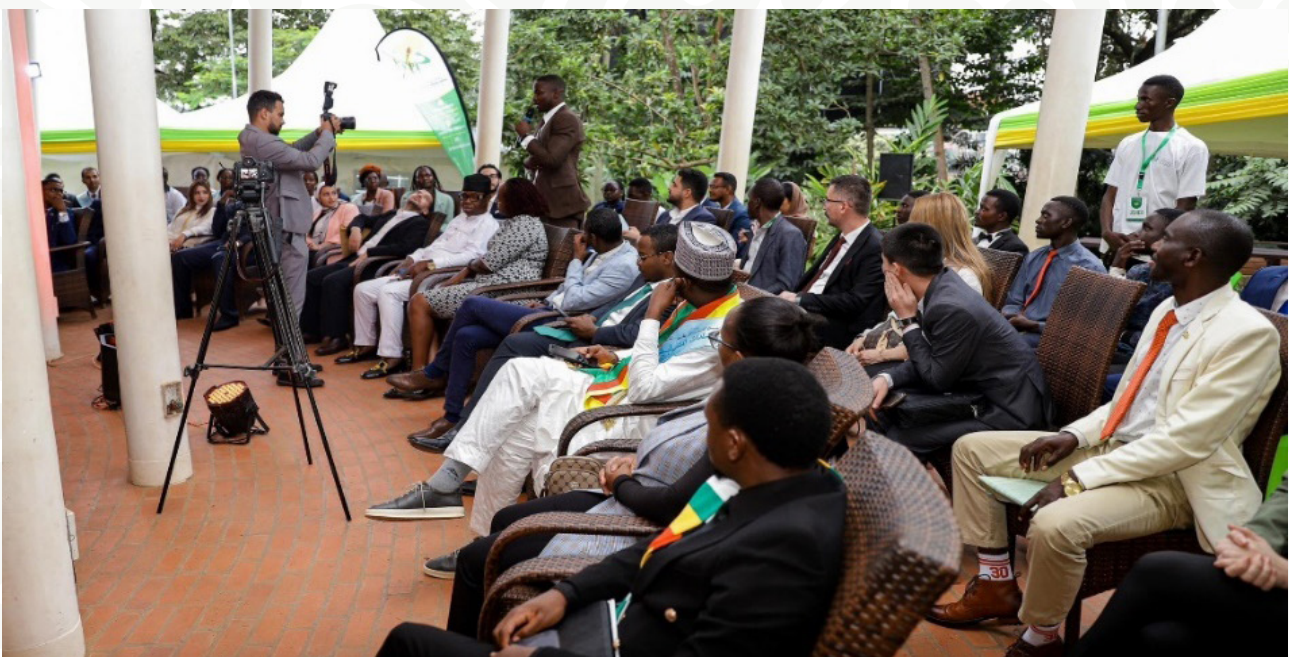
Delegates at Okot P'Bitek Pavilion for the fireside chat.

for participants including youth council members and youth peace ambassadors to engage with and exchange ideas, experiences and insights with a renowned leader and intellectual figure in an informal and intimate setting.