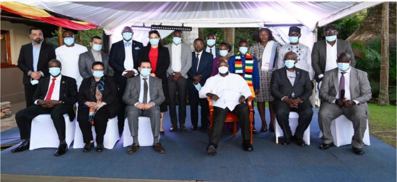
Group photo moment of the AAYC delegation with H.E the President.

AAYC and basing on his vision for the council, the President also committed to the Director General about the work of the AAYC. The President emphasized that it is important in this world for people to live together in peace and also peaceful coexistence among their different tribes, religions, and also for leaderships to prioritize always the issues that have common interests to many of their people than issues that divide the people.