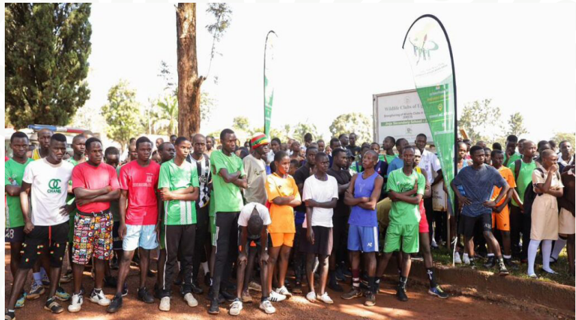
The runners warming up to start the marathon

The gala attracted over 500 people including young men and women from Jinja Secondary School and various parts of the Busoga Sub-Region, delegates from AAYC member countries including, Kenya, Burundi, Eritrea, Morocco, South Africa, Democratic Republic of Congo, Ethiopia, Jordan, Sudan, Nigeria, Zimbabwe, Libya, Somalia, Malawi, Cameroon, Azerbaijan, Palestine, Madagascar, Lebanon, Indonesia, Cape Verde, Bangladesh, Benin,