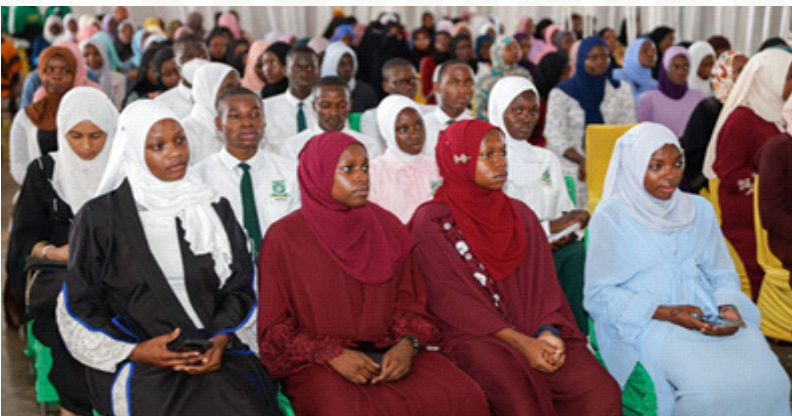
The Students of IUIU Kabojja Campus Attending the 20th Anniversary of AAYC.