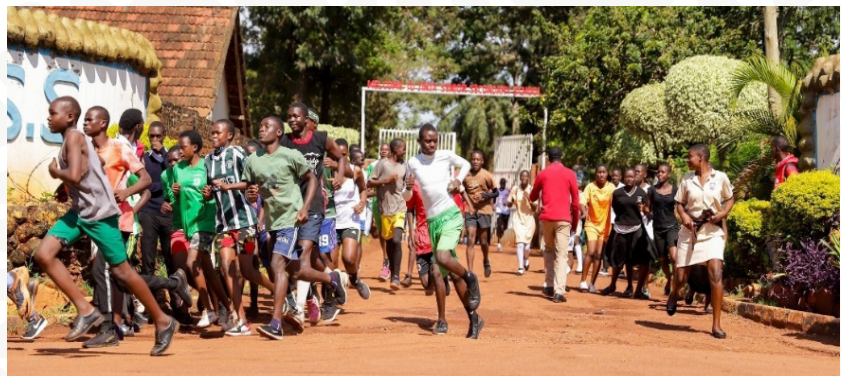
The runners setting off for the 5km marathon in Jinja