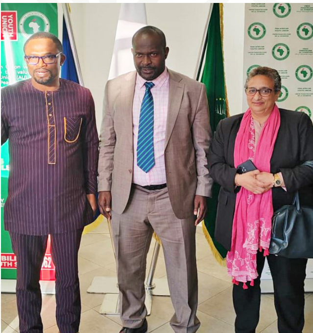
The Secretary General Pan-African Youth Union Hon Ahmed Bening Wiisichong hosted the AAYC SG and Deputy SG at their headquarters in Morocco.