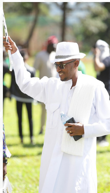
Showcasing of the Cultural attires at the Gala

Tunisia and Ghana among others. The event also featured a band match from the Source of the Nile Hotel to Jinja Secondary School followed by a five-kilometer run in Jinja which created a memorable experience for the attendees.