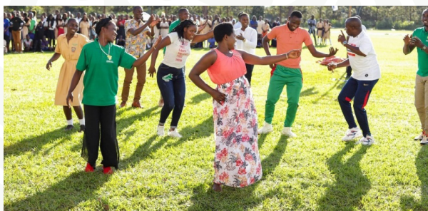
The Delegation from Burundi dances to Kirundi dance

The Gala highlighted diverse performances, including the Kisoga dance from Eastern Uganda, Kiganda dance from the Central region of Uganda, Rarakaraka dance from the Northern Region of Uganda, and traditional dances from Libya and Egypt along with a traditional wear fashion show.