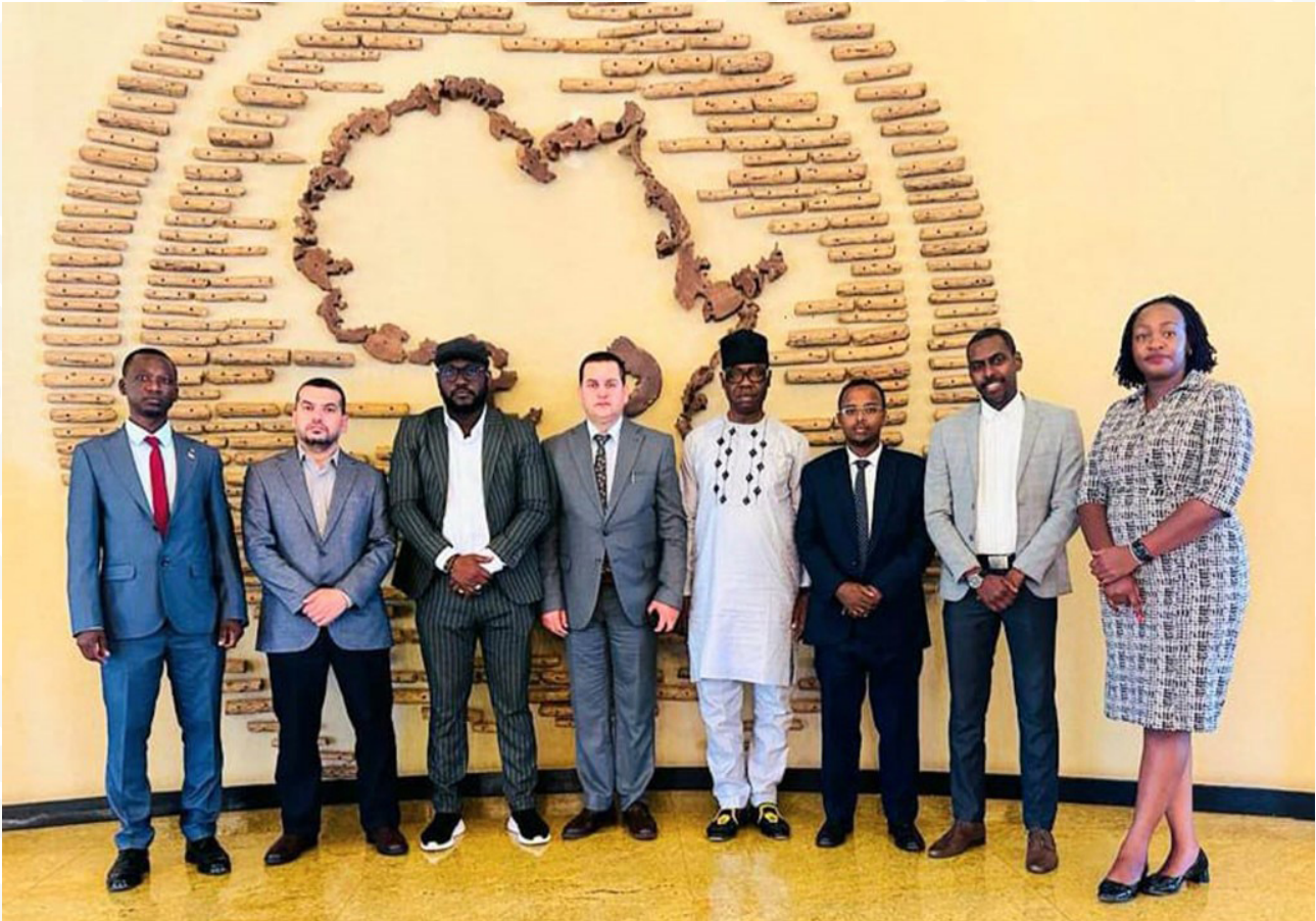
Part of the AAYC team at Munyonyo Speke Resort ahead of the meeting.