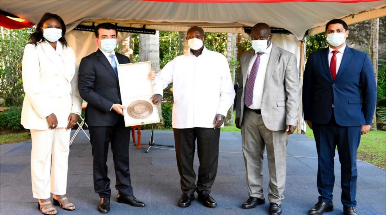
The ICESCO team presents a souvenir to H.E Yoweri Kaguta, President of the Republic of Uganda and Patron of the AAYC as a token of appreciation.