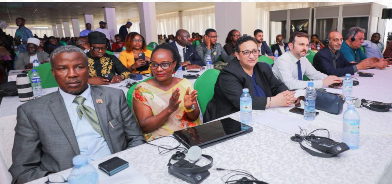
Some of the delegates in attendance for the Mental Health day at KIU.