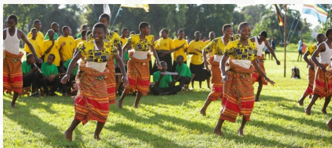
Jinja S.S MDD club captivate the audience with Kisoga Dance