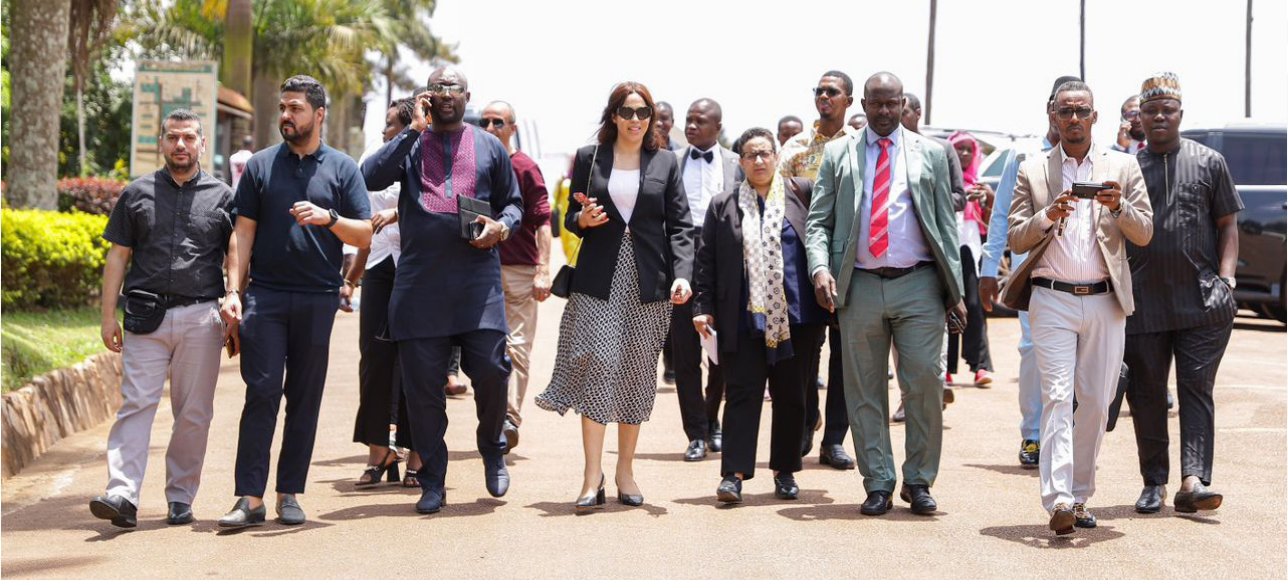
Arrival of the AAYC Delegates at the Islamic University in Uganda.

The AAYC Secretariat normally observes an anniversary week spacing from the start of March and climax on the 9 th of March, the actual founding day of the AAYC chosen to remember the date of the last Afro Arab Summit which had been held in 1979.