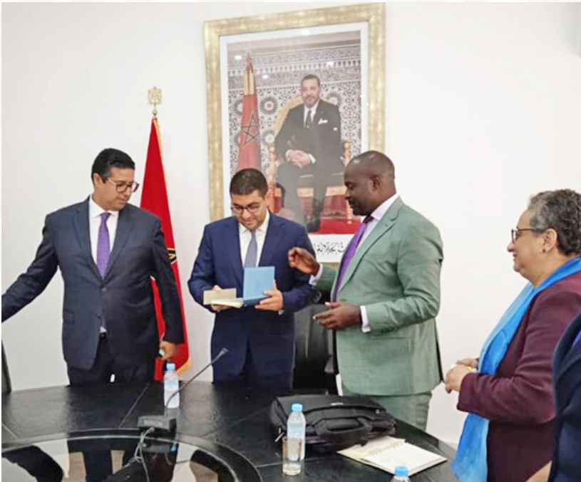
The Minister for Youth, Culture and Communication of Morocco, Hon. Mohammed Mehdi Bensaid hosted the AAYC Executive team in preparations for the anniversary.

In the lead-up to the anniversary, a series of preparatory activities were conducted to ensure the event's success in and outside Uganda, with both the local and international organizations and governments as highlighted below. During the same period. The Afro Arab Youth Council worked closely with all its partners to coordinate these strategic meetings. Engagements with member countries and local communities were also prioritized to ensure broad participation and representation.