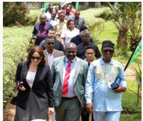
Departure of the Delegates at IUIU Kabojja Campus.