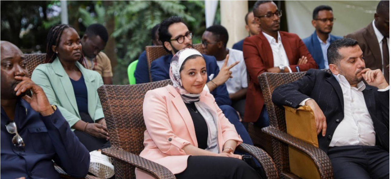
Some of the moments at the fire side chat as delegates engaged in a conversation with Prof. Roland Lumumba.