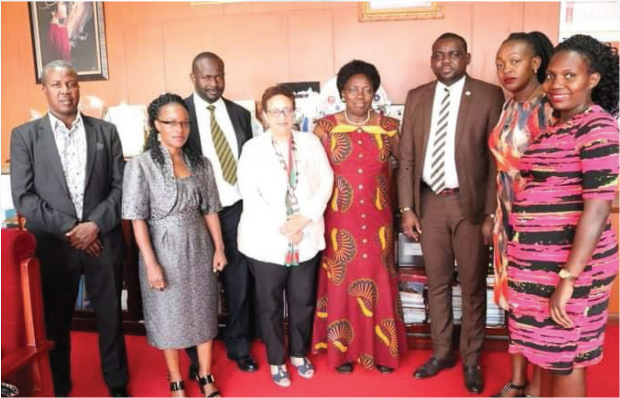
A delegation from AAYC, meets the Speaker of the Parliament of Uganda Ms Rebecca Kadaga 2019.