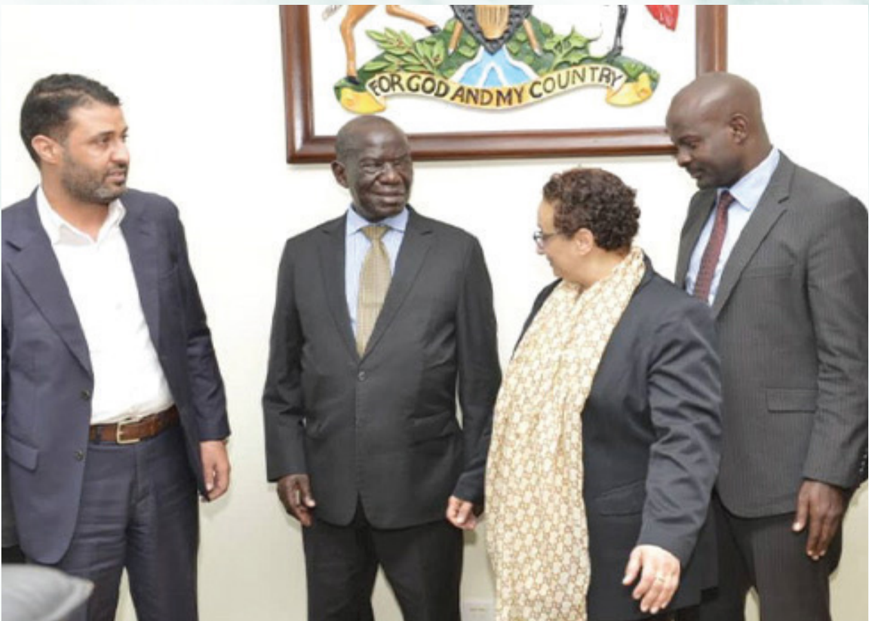
Vice President Edward Kiwanuka Ssekandi meeting with some members of the Executive Committee 2019.