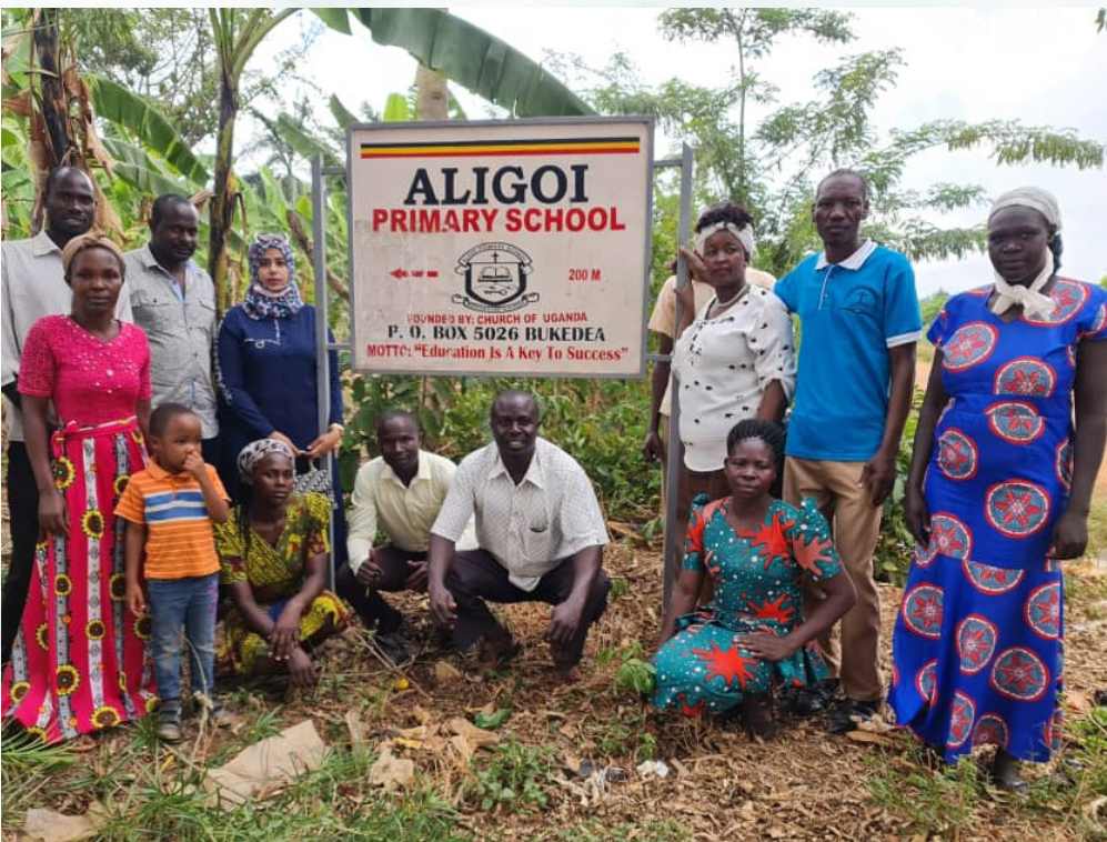
A pre-visit of AAYC staff at Aligoi primary for fruit tree planting project in partnership with School management in Bukedea district, Teso sub region

The youth are greatly discouraged to invest in agriculture and more so there are no measures yet successfully taken to motivate the youth to also consider agriculture as a means of earning great livelihood. In most cases the youth view agriculture as one for the peasants and also failures which is not the case. AAYC in partnership with RUFORUM wants to bring a brighter version of youth who are engaged in agriculture and the costs and benefits of agriculture.