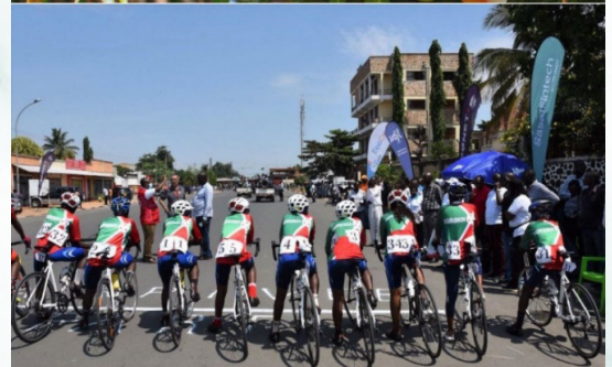
"Bicycle racing on the Source of the Nile -Jinja Eastern Region"