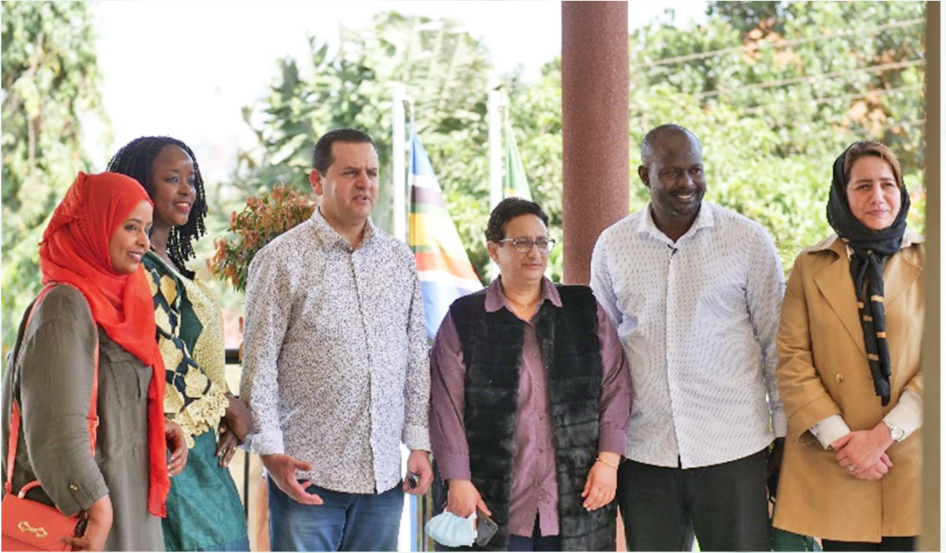
AAYC leadership ready for duty