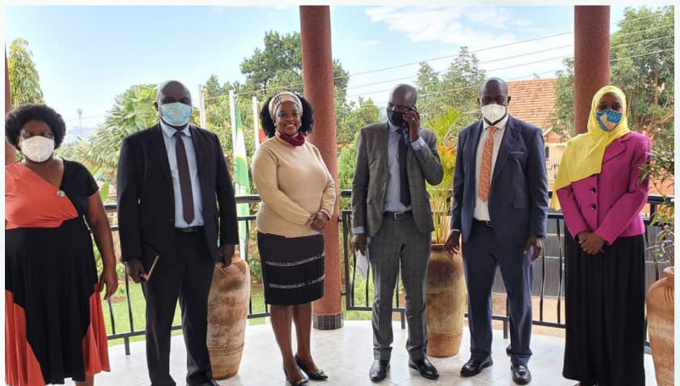
A delegation from the Office of the President and the AAYC Staff at the Secretariat.

The AAYC, being under the Office of the President, we were obliged to host a delegation from the office of the president. The visit was necessitated to provide guidance and support of the council in its embryonic stages and also setting up systems of accountability and ensuring proper utilization of the funds received from the Patron through the Office of the President. However, the delegates appreciated how well the Secretariat has taken off after its relocation to Uganda.