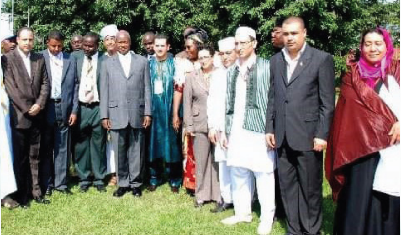
Afro-Arab Youth Council Executive Committee and Youth Delegates with the Patron, H.E.Y.K. Museveni, at Arab Youth Festivals 2008 in Munyonyo