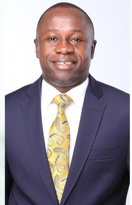
HON. PETER OGWANG Minister of State, Office of the President

A major milestone here in Uganda has been in the fight against HIV/AIDS which was harvesting many young people and orphaning children at very early ages. We had child headed households, and many