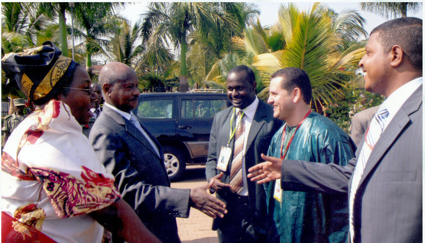
His Excellency Yoweri Kaguta Museveni being received by the AAYC International Executive Committee and Hon. Saïda Bumba (Minister of Labour, Gender and Social Development) for the opening ceremony of the 2nd Afro-Arab Youth Festivals 2008, at Speke Resort, Munyonyo.