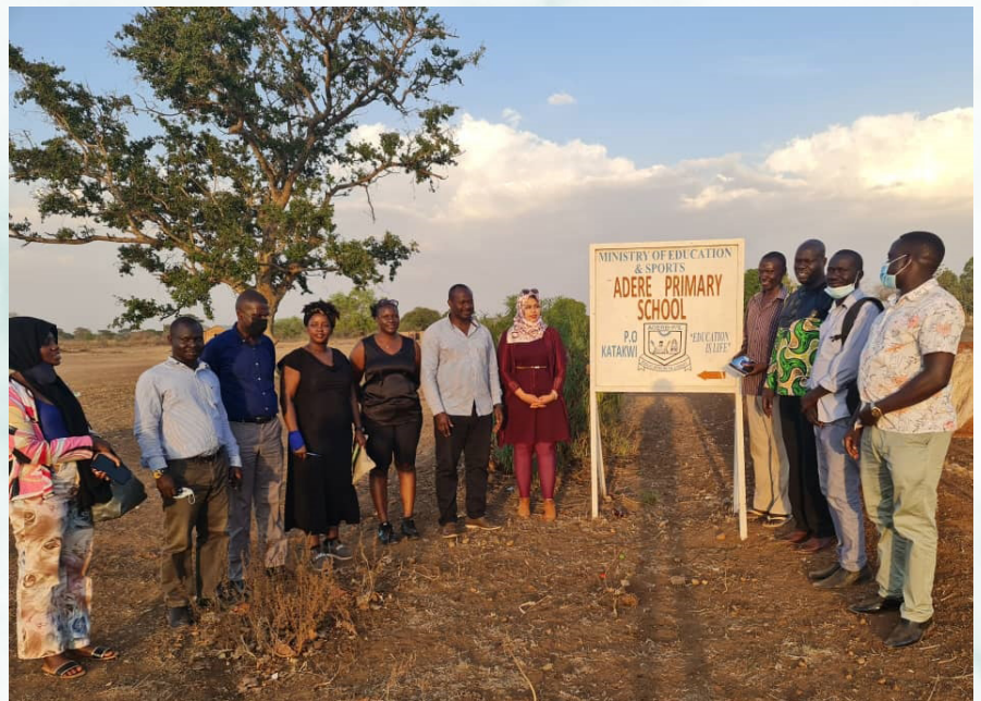
A pre-visit to Adere Primary School in partnership with District Local Government for fruit tree planting project in Katakwi district, Teso sub region.

AAYC contributes to the fulfilment of Sustainable Development Goals (SDGs) which among the program is zero hunger. When a population has food security then there will be a possibility to have a hunger free generation. AAYC has a project to plant trees in schools as a way of increasing food availability and also providing a nutrition which improves the diet and wellbeing.