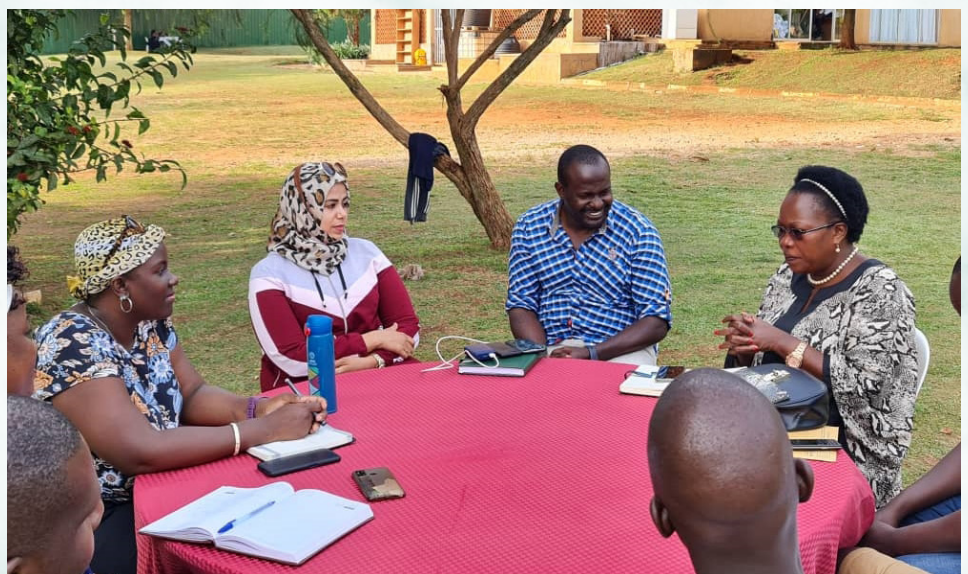
AAYC in preparatory meeting with M.S Machora Kito the Busoga Kingdom Minister of Foreign Affairs (right) in Jinja.

The anniversary shall be a three-part celebration starting with a Bicycle Race dubbed “The Source of the Nile Bicycle Race” in Jinja-Busoga subregion. AAYC is concerned with the amplified diseases which are mainly brought about by lifestyle for example obesity, heart disease, diabetes,