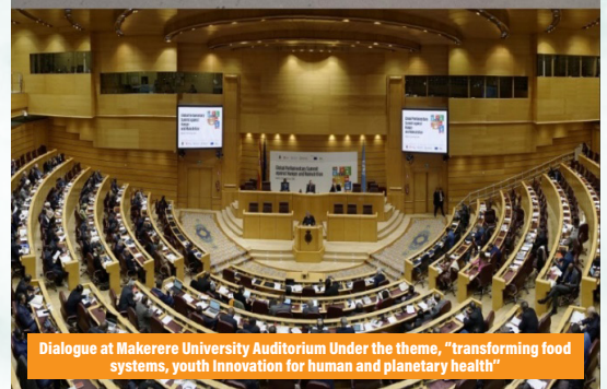
Dialogue at Makerere University Auditorium Under the theme, "transforming food systems, youth innovation for human and planetary health"