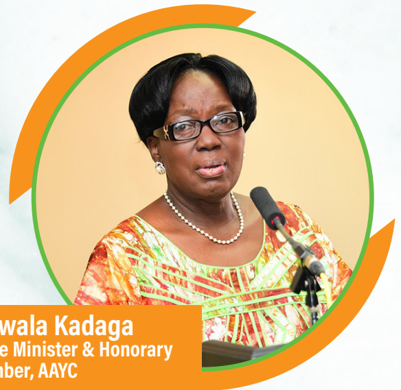
Hon. Alitwala Kadaga 3rd Deputy Prime Minister & Honorary Member, AAYC

The inspiration and motivation for the establishment of the Africa Arab Youth Council was born out of the understanding by the youth then that there are social cultural and traditional similarities between the people of Africa and the Arabian space. More so, considering the fact that over 70% of Arabs are in the continent of Africa, these social cultural similarities and affinity can be explored through multilateral and bilateral relationship and cooperation among the political leadership and the people of these define space, in order to promote the common cause of socio-political and economic development and prosperity of the people of the Africa and Arab space. It is a pragmatically considered opinion that the Youth can achieve these goals, if they realize that they as youth and young people have great roles to play in harnessing of these socio-cultural and traditional