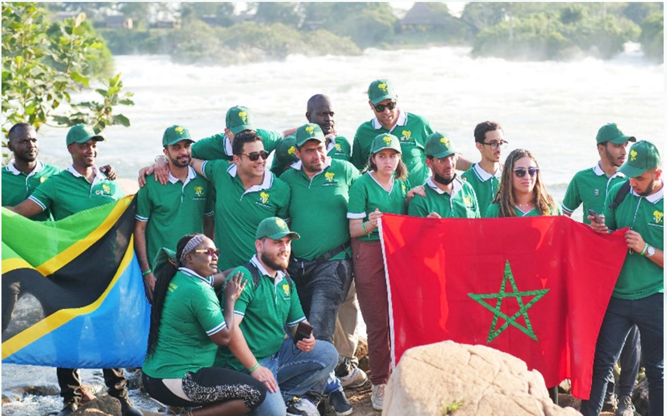
18th anniversary delegates at Busowoko falls, the turning point for the cyclists in the Bicycle Race