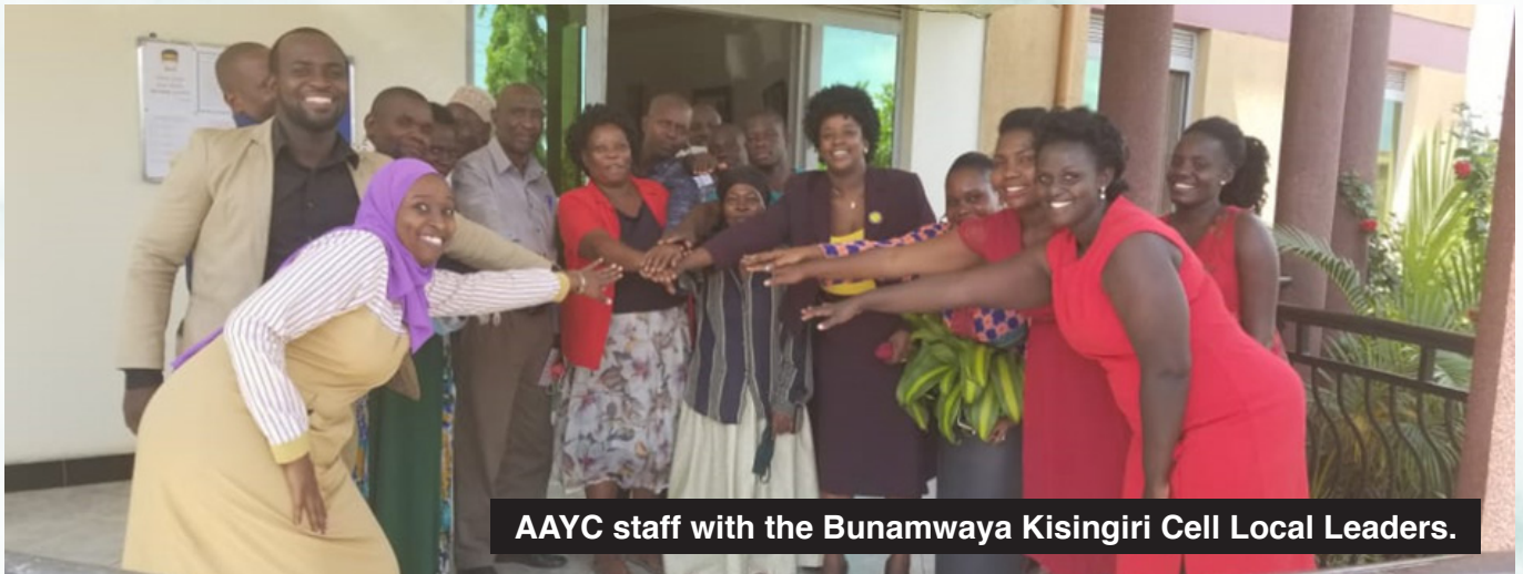
AAYC staff with the Bunamwaya Kisingiri Cell Local Leaders.

With these and many more programs in the works, we have been very busy and continue to carry out our mandate and work towards the betterment of the Afro Arab Youth and the Youth in general.