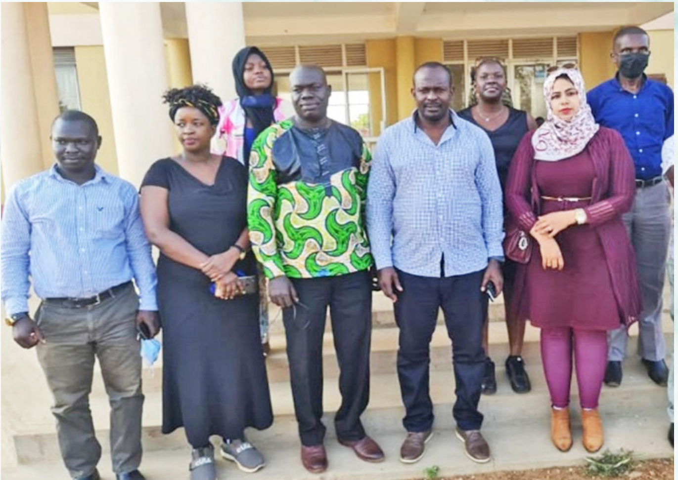
AAYC staff with the Chairman Katakwi District Local government at the District Head Quarters