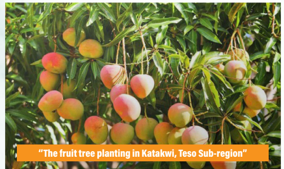
"The fruit tree planting in Katakwi, Teso Sub-region"