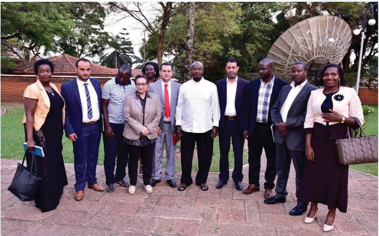
Afro-Arab Youth Council Executive Committee and Secretariat Staff meeting with the Patron, H.E.Y.K. Museveni, at State House Nakasero, 3rd February, 2019