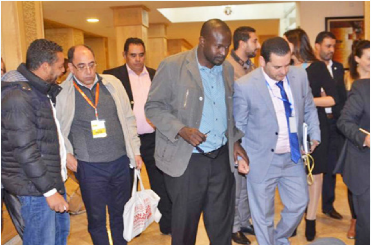
The President AAYC and the Vice President AAYC, participate in a "Peace for Libya" Symposium in Morocco, 2018.